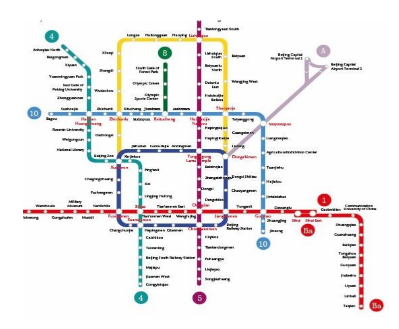
Fig 2. Sketch map of Beijing urban rail transit network

The paper proved the model having the Beijing local rail transit network for example. The network simplified schematic map is as figure 2.