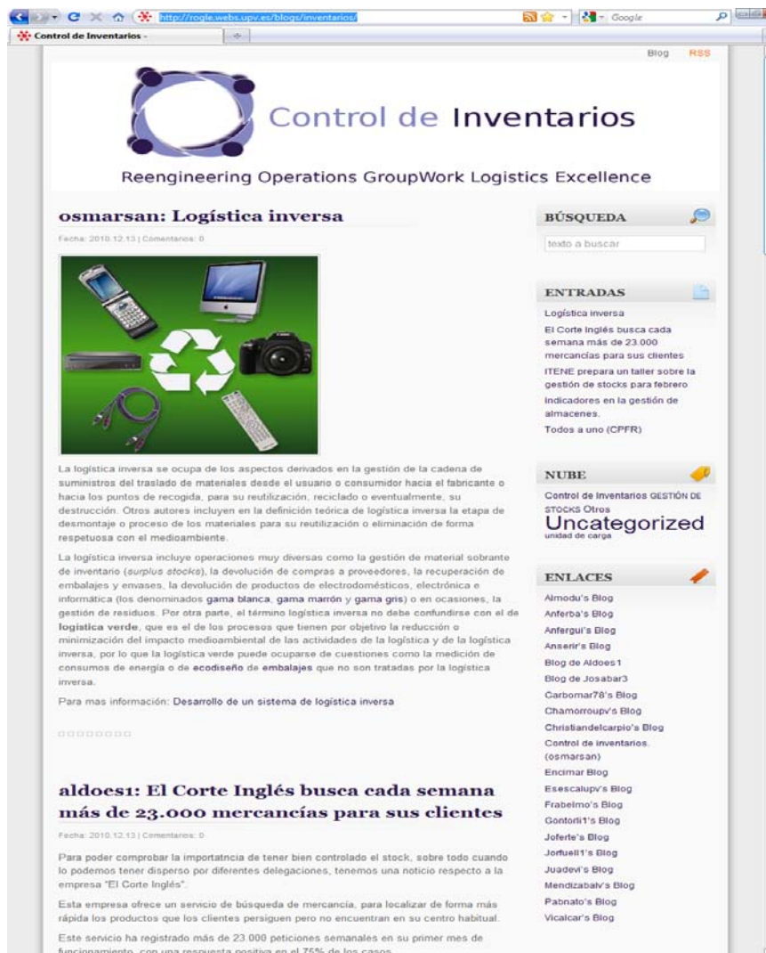
Figure 3. "Overview of a blog".