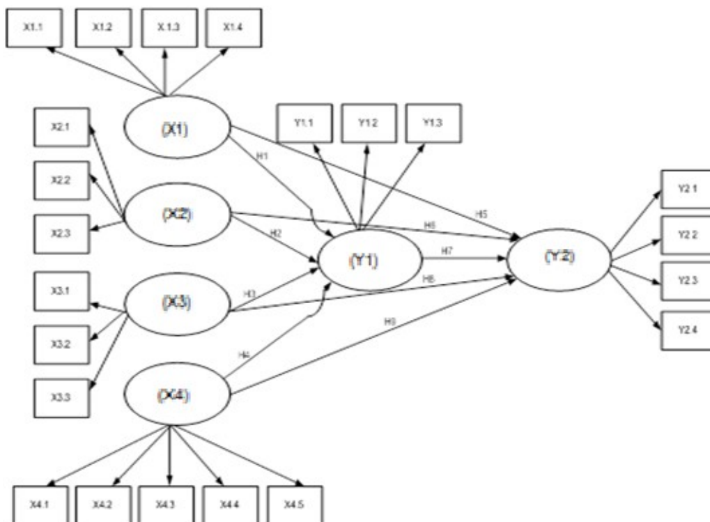
Figure 1. The research framework

Notes: Y_2 =performance; Y_1 =corporate strategy; \beta_1, \beta_2, \beta_3, \beta_4 =regression weight; X_1 =industrial environments; X_2 =operating environments; X_3 =remote environments; X_4 =internal environments. The research framework is as Figure 1.