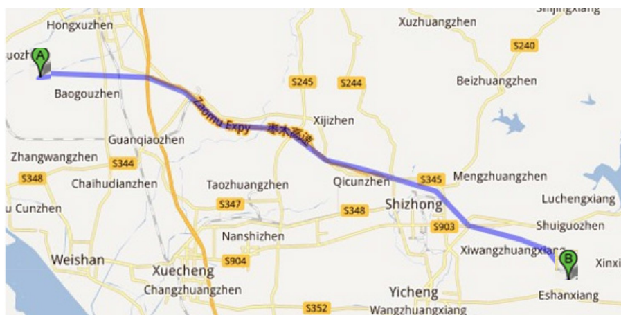
Figure 1. Transportation routing of the electricity coal supply chain

In China, the main transportation methods are railways, highways and waterways. In the coal transportation process, this paper only considers coal that is transported from the coal mine to the power plant. Ammonium nitrate and other blasting materials which are transported to the coal mine, and ammonia (NH 3 ), hydrogen chloride (HCl), sodium hydroxide (NaOH), calcium carbonate (CaCO 3 ), etc, which are transported to the power plant are not included in the LCA. According to the investigation, from JZCM to SLQP, the coal is shipped by steyr-king heavy duty trucks which have a loading capacity of 24 tons. The distance is 93 Km, the total diesel fuel consumption is 36L, and the transportation routing is presented in Figure 1.